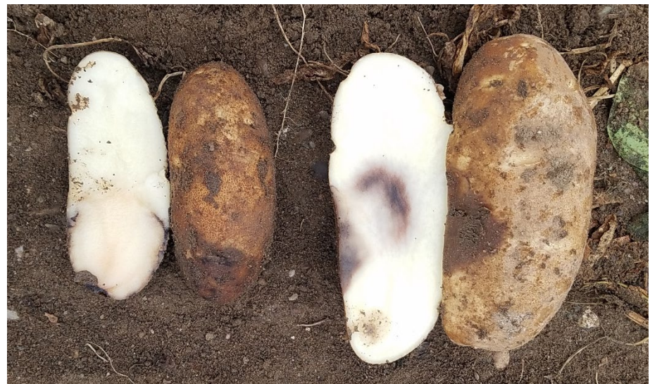
Figure 1. The tuber on the left exhibits symptoms of pink rot. The pathogen has entered through the stolon end of the tuber. The infected tissue in cross-section has a creamy, off-white color with some dark tissue on the edge of the infected area. The tuber on the right shows symptoms of Pythium leak. The infection occurred on the side of the tuber. The infected tissue in cross-section is light to dark gray and is wetter and darker than pink rot.

Pink rot, caused by the oomycete pathogen Phytophthora erythroseptica , can cause significant problems in potato production. Pink rot is typically more severe with short rotations and the use of susceptible varieties, such as Russet Norkotah and Clearwater Russet. The pink rot pathogen normally infects roots and stolons and then grows into the tuber. Most infections in tubers will originate at the stem end (Figure 1). This is different from Pythium leak, another disease that can appear similar to pink rot, which usually develops through eyes, lenticels, or damaged tissue (like pink eye) in the field (Figure 1). Pythium infection in the field is not common, and most infections occur at harvest through wounded tissue.